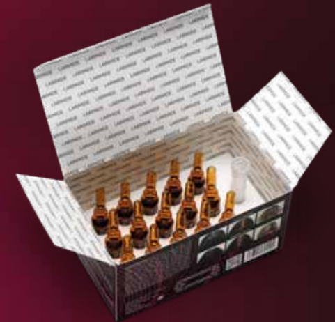
Detail of the inside of the box

KOJAXIN is not only intended for those who want to recover their hair and reverse the loss process , but also for those who want to prevent thin and sparse hair, and for those who simply want to maintain the quality of their hair and use it as a preventive treatment.