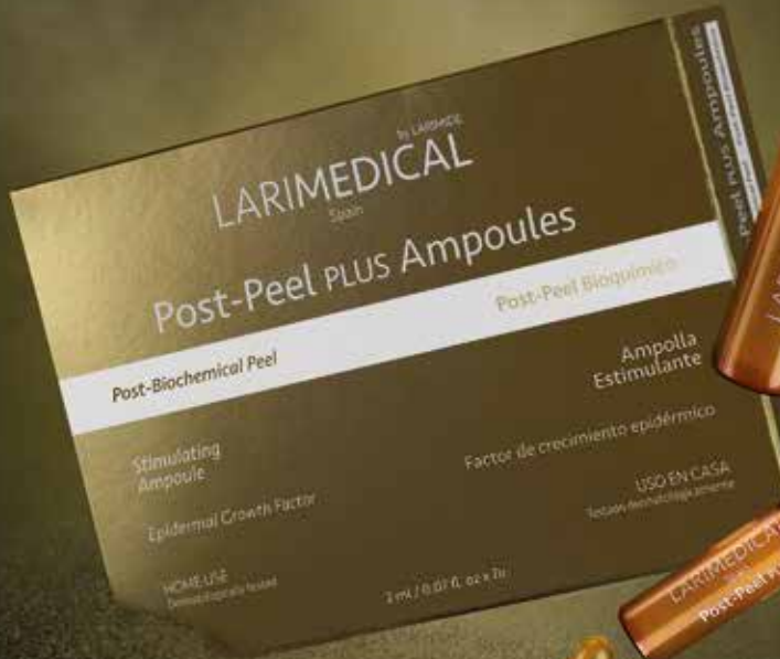
Post-Peel PLUS Ampoules